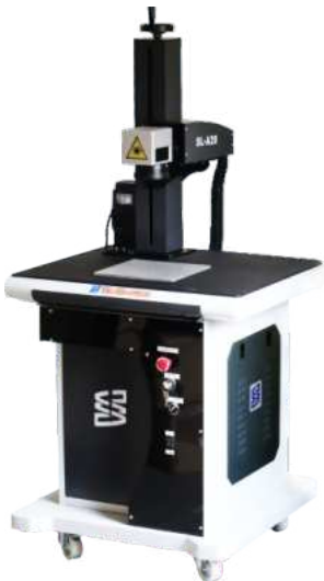
Advance Laser Marking Machine