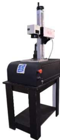
Compack Laser Marking Machine