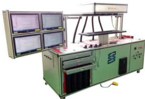
Multihead Laser Marking Machine