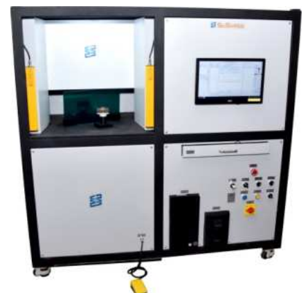
Automatic Laser Marking Machine