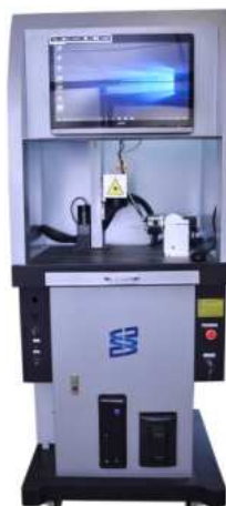
Industrial Enclosure Laser Marking Machine