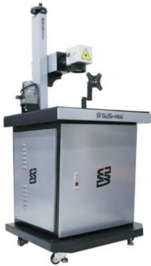
Standard Laser Marking Machine