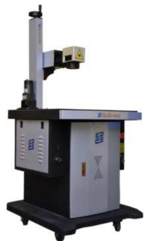
Desktop Laser Marking Machine