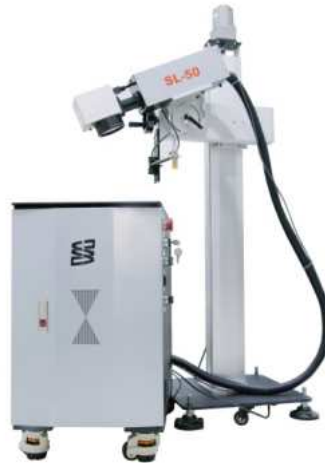
Flexible Mould Laser Marking Machine