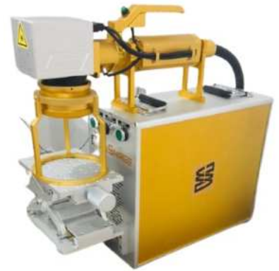
Handheld Laser Marking Machine